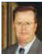
Stephen Robertson MP Minister for Health

To find out more about the progress being made with the Health Action Plan, visit www.health.qld.gov.au or www.thepremier.qld.gov.au