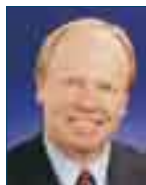
Peter Beattie MP Premier of Queensland

The only area in which we have not made enough progress is in getting the Commonwealth Government to do its fair share to fix our health system. While the Commonwealth has agreed to a small number of full-fee-paying medical places, we need a lot more and also need more funding for health in general.